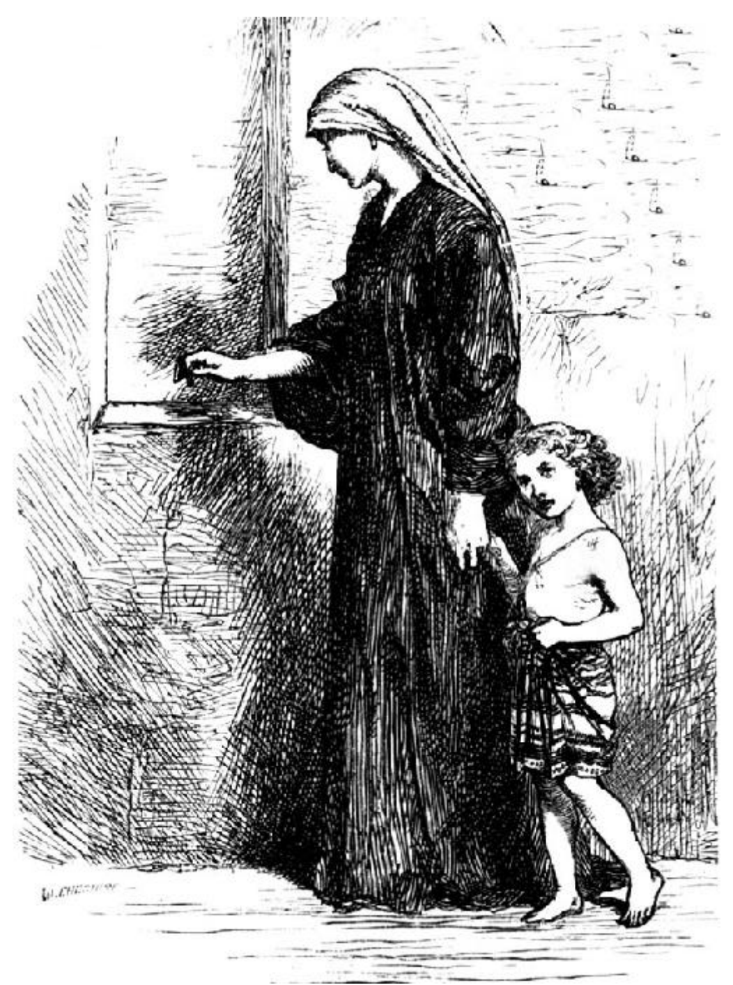
Mark 12:43-44 So He called His disciples to Himself and said to them, "Assuredly, I say to you that this poor widow has put in more than all those who have given to the treasury; for they all put in out of their abundance, but she out of her poverty put in all that she had, her whole livelihood."