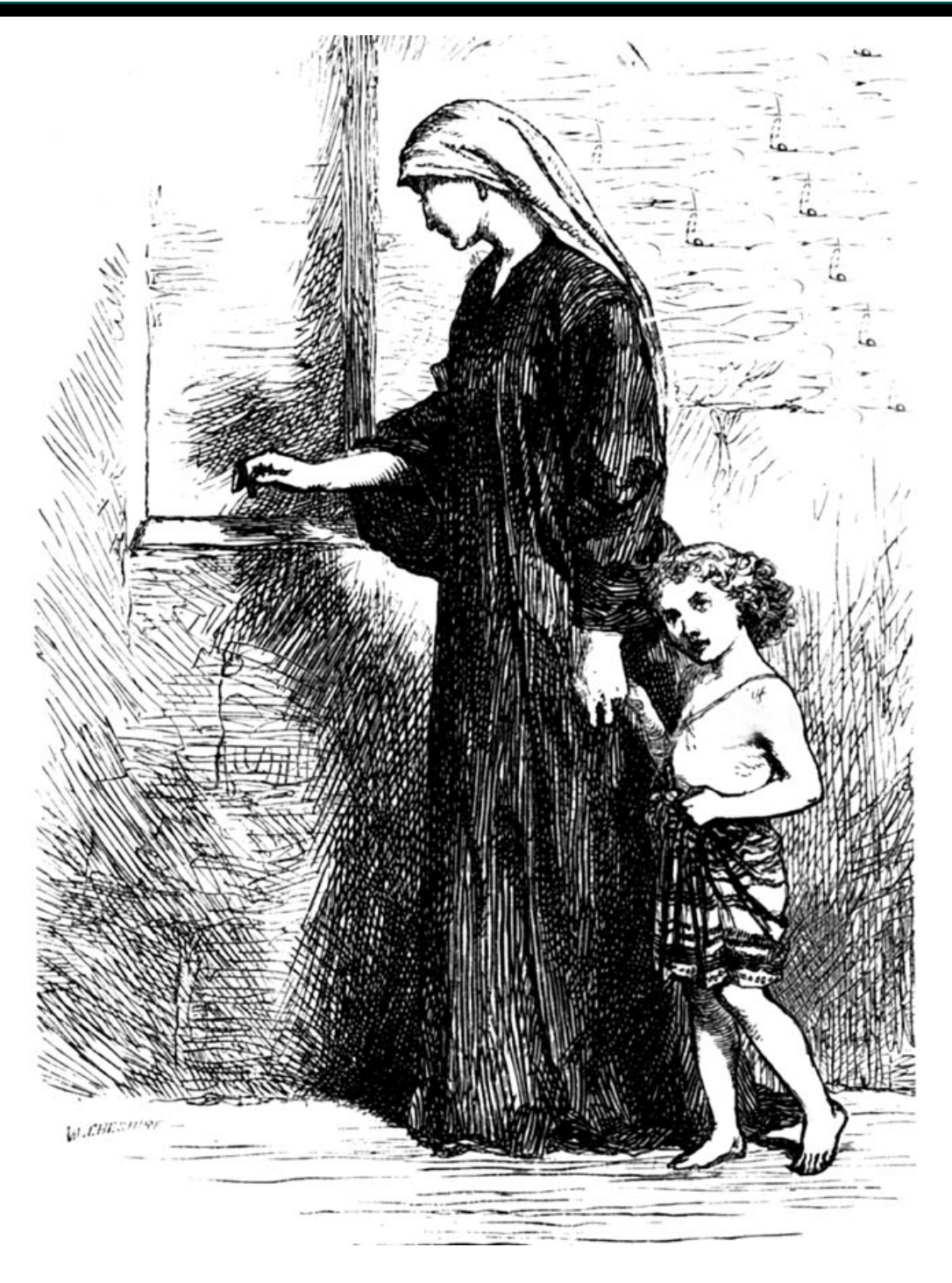
Mark 12:43-44 So He called His disciples to Himself and said to them, "Assuredly, I say to you that this poor widow has put in more than all those who have given to the treasury; for they all put in out of their abundance, but she out of her poverty put in all that she had, her whole livelihood."